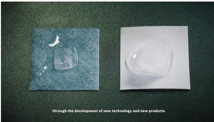
Assessing the insulation effectiveness of the product (right: Finesulight™)