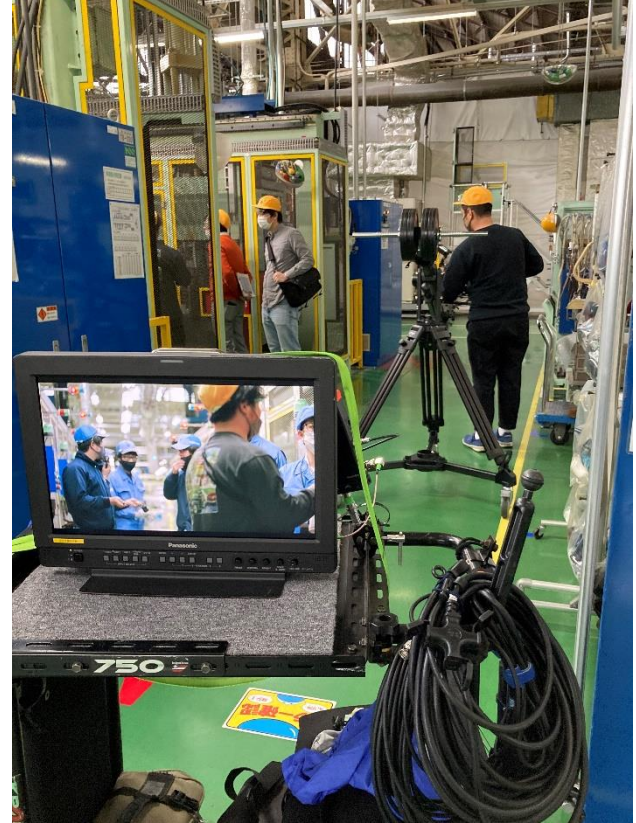
Shooting video at anti-vibration rubber production line in Komaki plant

The Sumitomo Riko Group considers CASE to be a large opportunity. As such, we have created this content to widely communicate that we aim to further expand our business while searching for new business partners. As a unique system supplier for automotive who is involved in manufacture of materials from the top of the MONOZUKURI stream to final products at the bottom of the stream, our particular strength lies in the "power of materials".