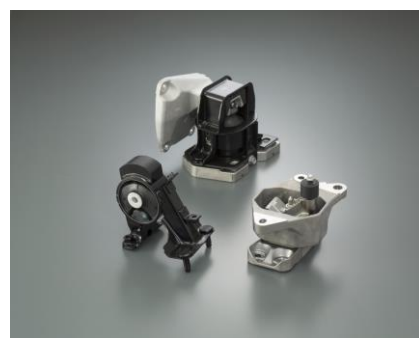
Motor mounts installed in the Mirai, Toyota’s FCV

Our Group is already providing motor mounts for NEVs that use an electric motor, such as EVs, PHVs/PHEVs and FCVs. While supporting the motor, these parts reduce high-frequency vibrations and unpleasant noise, which differ from those of an internal combustion engine, and improve the ride comfort. They have a proven performance in Japan, China and all Western markets wide range of vehicles from small city cars up to the luxury segment.