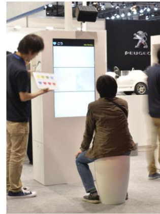
SR sensors are installed in the seat of a chair

At this trade show, we will exhibit a special chair with built-in SR sensors to detect the vital data of someone who just sits in it. Visitors to our booth will be able to try it out for themselves.