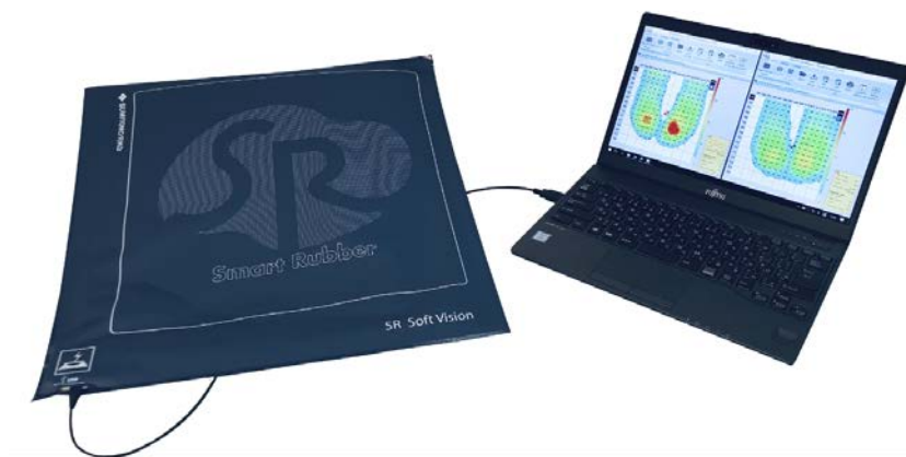
SR Soft Vision (European version)