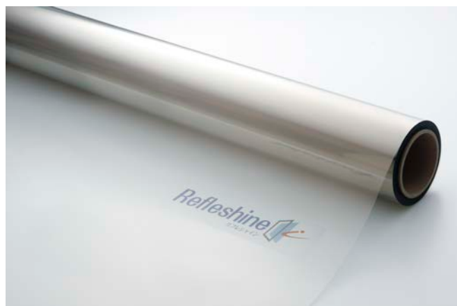
Refreshine, highly transparent reflecting and insulating film for windows