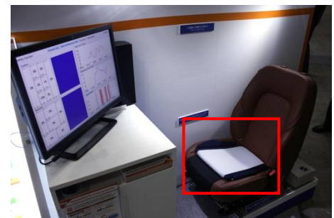
Cushion with built-in SR sensor installed in seat

The system uses the results to assess the driver's condition, such as fatigue, drowsiness, sudden illness etc. It can then connect to an advanced service, such as alerting the driver, actuating a driver assistance system, or sending a notification externally.