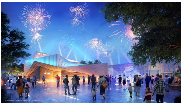
Architectural Design of the Sumitomo Pavilion

Trees from the “Forests of Sumitomo”, owned by the Sumitomo Group, will be used throughout the pavilion’s architecture construction. Based on the concept of “ valuing each life, one tree at a time ”, we have considered and discussed extensively on how the wood should be processed and decided to create “Plywood” so that the tree can be used in its entirety. The wood will be cut into thin strips using a rotary cutter and turned into plywood while the leftover “Peeling Core” from peeling the logs will be turned into benches to be set up throughout the pavilion.