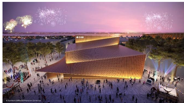
Architectural Design of the Sumitomo Pavilion