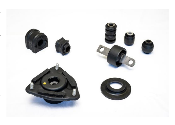
(Clock-wise from back-right) Suspension bushes (4), coil insulators, strut mounts, stabilizer bushes (2)

From the time of entering the automotive anti-vibration rubber market in 1954, we have applied the vibration control technology which we have developed and