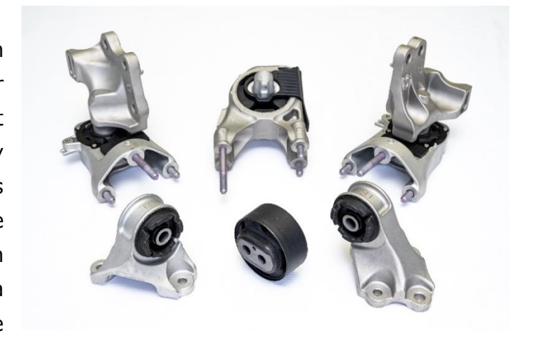
eAxle mounts: Front three for the rear and back three for the front.

Anti-vibration rubber (mount) has been newly developed to support front and rear wheel eAxle. It not only enhances comfort in the vehicle and increases the already superior drive response of BEVs, it has been designed to protect high voltage components in the eAxle in the event of an impact. The metal components contain a large amount of aluminum to ensure the mount is kept light-weight.