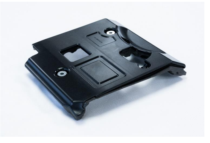
eAxle cover: Resin surface, urethane inside

Installed at the bottom of the rear eAxle, the eAxle cover is effective against vibrations and noise across a broad range from low to high frequencies. As BEVs do