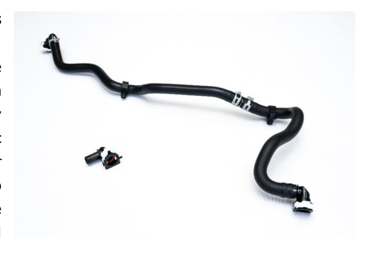
Cooling hoses and connectors for the electric system (front left)

Developed for the same platform, the optimum water hose module utilizes a water cooling format to cool the battery and other components of the electric system. The rubber hose and connector made of resin forms a cooling circuit to maintain the performance and optimize the efficiency of the motor, battery and all other components.