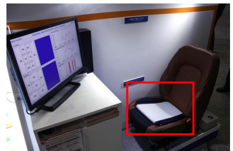
Cushion with built-in SR sensor installed in seat

SR sensors are either built into the seat or manufactured into the shape of the cushion and fitted onto the seat. The driver's heart rate, breathing, body motion, and so on are detected based on changes in pressure on the surface of the chair measured by the SR sensors. The system uses the results to assess the driver's condition, such as fatigue, drowsiness, sudden illness, etc. It can then connect to the necessary services, such as alerting the driver, actuating a driver assistance system, or sending an external notification.