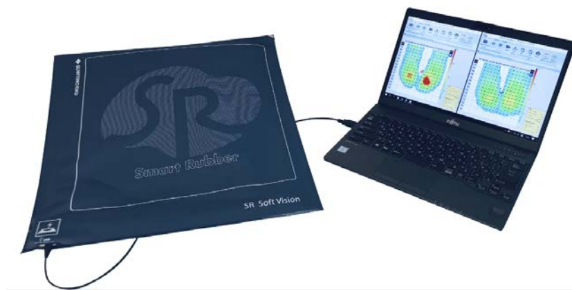
SR Soft Vision (European version)