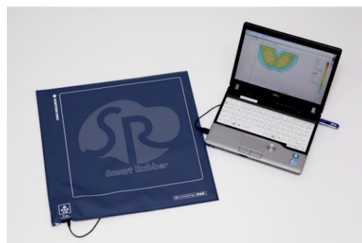
SR Soft Vision

Since the release in 2013 of the first SR Soft Vision, the distribution version, we have extended the product portfolio to suit various situations of use, including a wireless version that can be used with a mobile device such as a tablet or a smartphone, and a whole-body version that can measure pressure distribution of the entire body from head to toe. SR Soft Vision can be used as a wheelchair seating tool, a bed sore management tool, or a rehabilitation support tool.