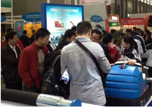
Scene from the previous Bauma trade fair in 2014